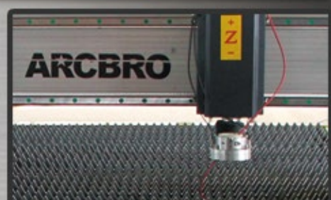
Strong guider and rack, most durable Anti-collision system, save plasma torch life