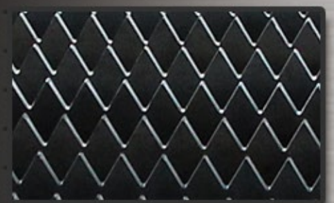
Serrated table to keep plate stable